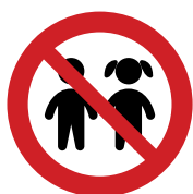
Keep away from children