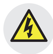
Electric shock risk