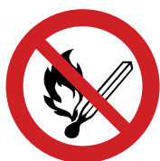
No naked flames

Store this manual in close proximity to the batteries at all times and ensure it is accessible to the relevant personnel.