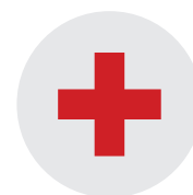
First aid / medical assistance