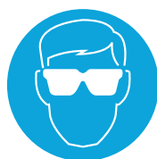
Wear safety goggles